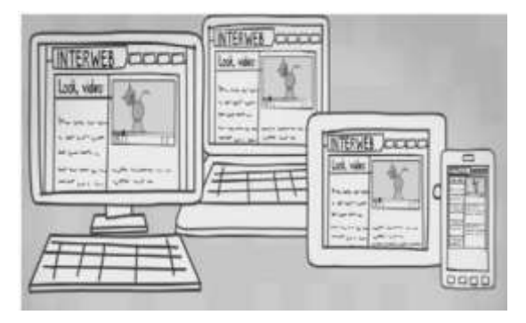
Fig 1. HTML5 cross-platform

With the development of HTML5 it has wide range of applications in multimedia direction [3]. It can play audio and video and supports animations from the browser without the need of the proprietary technologies. The features of HTML5 would add up value for web designers and developers.