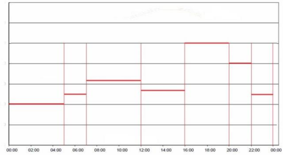
Figure 3: Load profile

Figure 3 shows the load profile estimation for load number 1 in 24 hours of a day.