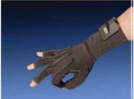
Fig. 2 Data Glove

Instrumented data glove approaches use sensor devices for capturing hand position, and motion. These approaches can easily provide exact coordinates of palm and finger's location and orientation, and hand configurations [17] [21] [22], however these approaches require the user to be connected with the computer physically [22] which obstacle the ease of interaction between users and computers, besides the price of these devices are quite expensive [22], it is inefficient for working in virtual reality [22].