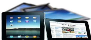
Figure 5. Tablet PC and I-Pads

This mobile device is larger than a mobile phone or a personal Digital Assistant and integrates into a touch screen and operated using touch sensitive motions on the screen. They are often controlled by a pen or touch of a finger. They are usually in slate form and are light in weight. Examples would include; I-pads, Galaxy Tabs, Blackberry Playbooks etc.