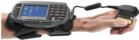
Figure 7. Wearable Computer Sample

dissipation, software architectures, wireless and personal area networks. The International Symposium on Wearable Computers is the longest-running academic conference on the subject of wearable computers.