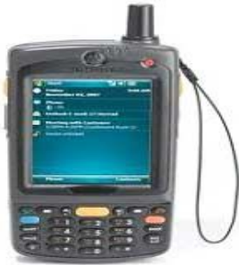
Figure 3. Personal Digital Assistant (PDA)

PDA devices, a user could; browsers the internet, listen to audio clips, watch video clips, edit and modify office documents, and many more services. They had a stylus and a touch sensitive screen for input and output purposes.