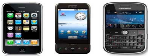
Figure 4. Smart Phone

This kind of phone combines the features of a PDA with that of a mobile phone or camera phone. It has a superior edge over other kinds of mobile phones. The smart phone has the capability to run multiple programs concurrently. These phones include high-resolution touch enabled screens, web browsers that can access and properly display standard web pages rather than just mobile-optimized sites, and high-speed data access via Wi-Fi and high speed cellular broadband. The most common [12] mobile operating systems (OS) used by modern Smart phones include Google's Android, Apple's iOS, Nokia's Symbian, RIM's Blackberry OS, Samsung's Bada, Microsoft's Windows Phone, and embedded Linux distributions such as Maemo and MeeGo. Such operating systems can be installed on many different phone models, and typically each device can receive multiple OS software updates over its lifetime.