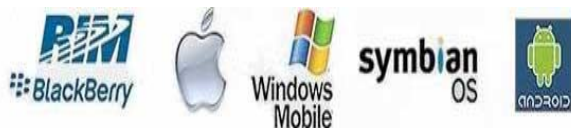
Figure 2. The Symbol of Most Common Operating Environments

Mobile computing is accomplished using a combination of computer hardware, system and applications software and some form of communications medium. Mobile hardware includes mobile devices or device components that receive or access the service of mobility. They would range from Portable laptops, Smart phones, Tablet Pc's, Personal Digital Assistants. These devices will have receptor medium that is capable of sending and receiving signals. These devices are configured to operate in full-duplex, whereby they are capable of sending and receiving signals at the same time. They don't have to wait until one device has finished communicating for the [2] other device to initiate communications. The characteristics of mobile computing hardware are defined by the size and form factor, weight, microprocessor, primary storage, secondary storage, screen size and type, means of input, means of output, battery life, communications capabilities, expandability and durability of the device. Mobile computers make use of a wide variety of system and application software. The most common system software and operating environments used in mobile computers includes MSDOS, Symbian, Windows 3.1/3.11/95/98/NT, UNIX, android, a specialized OS like Blackberry shows in figure 2.