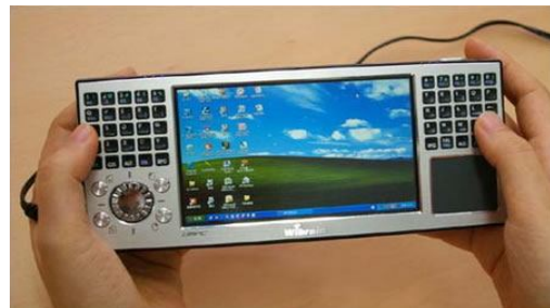
Figure 6. Ultra-Mobile PC

An ultra-mobile PC (ultra-mobile personal computer or UMPC) is a small form factor version of a pen computer, a class of laptop whose specifications were launched by Microsoft and Intel in spring 2006. Sony with its Vaio U series had manufactured the first attempt in this direction in 2004, which was however only sold in Asia. UMPCs are smaller than sub notebooks operated like tablet PCs, with a TFT display measuring (diagonally) about 12.7 to 17.8 cm, and a touch screen or a stylus. There is no distinct boundary between sub notebooks and ultra-mobile PCs. The first-generation UMPCs were just simple PCs with Linux or an adapted version of Microsoft's tablet PC operating system. With the announcement of the UMPC, Microsoft dropped the licensing requirement that tablet PCs must support proximity sensing of the stylus, which Microsoft termed "hovering". Second-generation UMPCs use less electricity and can therefore be used longer (up to five hours) and also support Windows Vista. Originally codenamed Project Origami, the project was launched in 2006 as a collaboration between Microsoft, Intel, Samsung, and a few others. Despite predictions of the demise of UMPC device category, according to CNET the UMPC category appears to continue to be in existence, however, it has largely been supplanted by tablet computers as evidenced by the introduction of Apple iPad, Google Android, Blackberry Tablet OS, and Nokia's MeeGo.