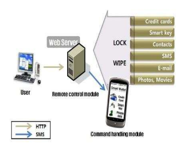
Fig. 1. Remote Lock and Wipe System

The remote lock and wipe service will be very useful when the smartphone is lost or stolen. However, there might be the case that the wrong user misuses this function by sending such commands to the normal users in order to interrupt the service. Thus, it is very important to check if the command is originated from the trusted server. In other words, the integrity of the commands must be checked. The traditional way to provide the integrity checking is simply to apply a digital signature scheme such as RSA or DSA signature. Note that RSA or DSA signature requires the key size of 1024 bits (i.e., 128 bytes) long to protect against active attackers over the wireless network. An obstacle here is that the command