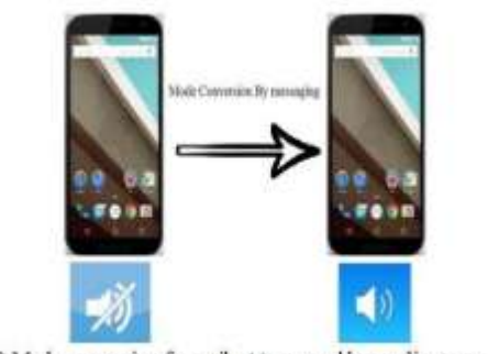
Fig 2:Mode conversion from silent to general by sending a message

When the SMS command notification is sent, the remote control module creates a secret key from the password using PBKDF. Using HMAC function with the secret key, the message authentication code (MAC) is generated on the command message along with the timestamp which is added to protect against the well-known reply attack. Then, the command message is sent with the MAC to the designated smartphone.