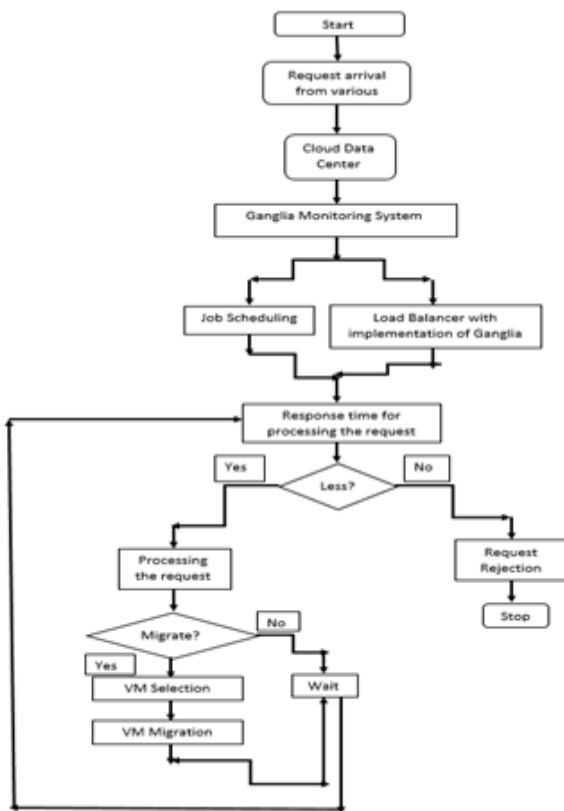
Fig. 2 Flowchart of Proposed Framework

The proposed model which is used for the purpose of high availability is shown on the below flowchart in Fig 2. The framework provides high availability, fault tolerance and better Quality of service for the web applications which will run on cloud data centers. Seeing that the load balancing, use of replication of data, monitoring and automation in operating system level virtualization has been responsible for the application which is to be run in the highly available environment of cloud data center. When large number of users hits at the same time, the data should be available so the Operating system level virtualization has been implemented to create the dynamic reflection of the whole system and implement it in the same way the application works. The master-master replication has been implemented for the data to be secure and available for the clients 24x7. The high availability and fault tolerance can be protected up to higher scope for the reliable structure.