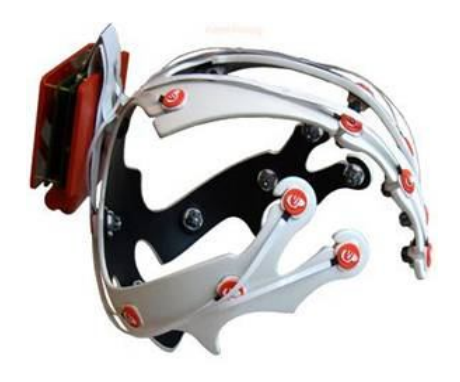
Figure 2 Future Headband