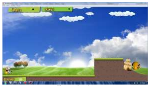
Figure 6 Level 1