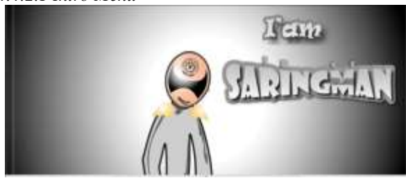
Figure 4 Intro Menu

Figure 4 shows initial appearance before entering the main menu contains intro introduction of characters and storyline.