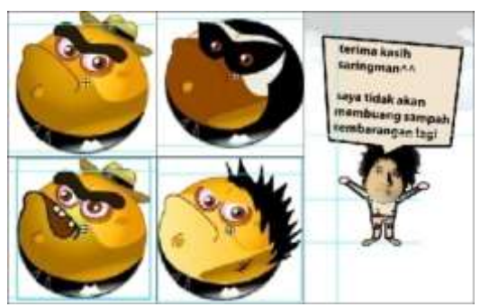
Figure 2 Enemy Character

Figure 2 shows the antagonist characters, citizens are less concerned who named tongpah.