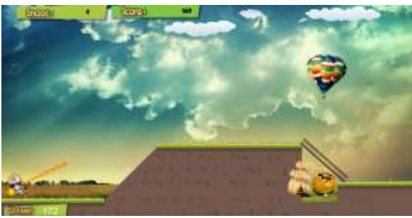
Figure 7 Level 2