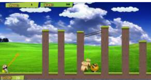
Figure 8 Level 3

Figure 6, 7, 8 shows contains the core game from level 1 to level 3.