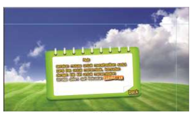
Figure 9 Help Menu