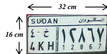
Figure 1. Sudanese License Plate

The size of all plate types is 32 ×16 centimetres (See Figure1). The plate has been divided into three regions; one region in the upper part, that contains the name of the country 'SUDAN' written in English and Arabic. The other two regions in the lower part, which divided by a silver metallic bar, one on the right this region contains numerals (1 to 5 numbers) written in English and Arabic, and the other region on the left side contains characters or character and number written in English and Arabic, the characters are an abbreviation of Sudan states' names, and the number to keep the sequence of the numbering. This study will focus on the first type: private vehicles as show in Figure 1.