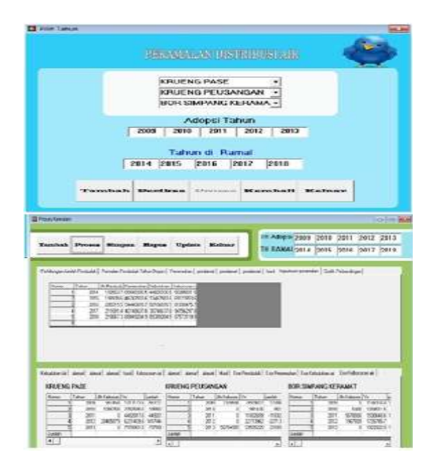
Figure 3.The Forecasting of Water Distribution

The data input form water requirement is location, adoption year, and the predicted year. The next form of forecasting process is the total of each water sources and the prediction of the level of water demand fulfillment, the population, the water demand and leakage. The form detailshows in Figure 3.