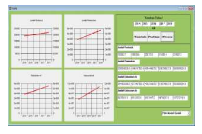
Figure 4. ForecastingGraph Form

Forecasting graph validation is used to see the population, theamount of demand fulfillment, the amount of water needed, the amount of water leakage based on the first period and the comparison level of each variable. The detail of the forecasting graph validation is shows in figure 4.