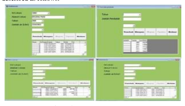
Figure 2 : Form Input Data

The design of input form offulfillment data, the population data, water leaks data, and the demand of the water can be described as follows: