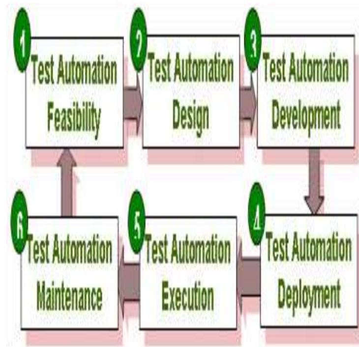
Figure1. Stages of Automation

Following figure shows various stages of a test automation process.